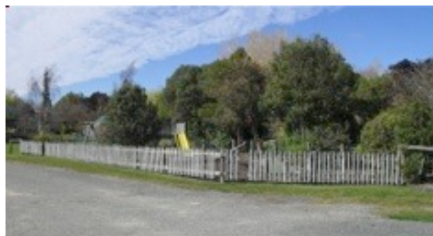
Children's playground before and after

The Community Service Supervisor is continuing to fit us into his work plans despite many requests for service in other areas.